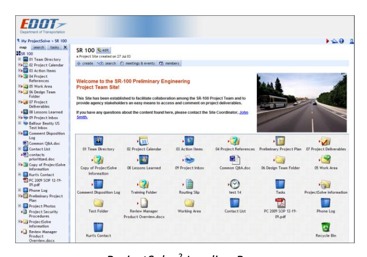
ProjectSolve <sup>2</sup> Landing Page